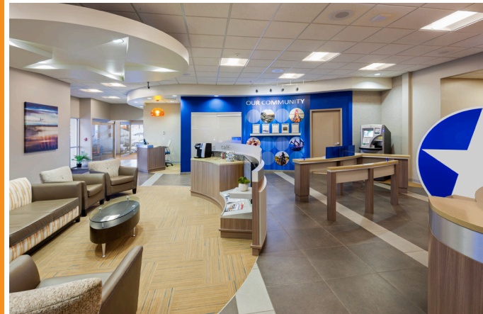
Above: Waiting and customer queue areas Left: Entryway and greeting area